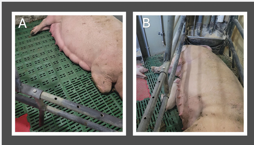
Figure 1: A) Normal udder development in a sow 24 hours prior to parturition that was not exposed to ergot alkaloid contaminated feed in contrast with B) poor mammary development in a sow after exposure to ergot alkaloid contaminated feed.

days prior to farrowing and 5 days after farrowing (Table 2). While group 2 consumed the contaminated feed for up to 14 days, there was no impact on mortality for that group (Table 2), so it was combined with groups 1, 5, and 6 to represent groups that had not been affected. None of the production variables were normally distributed and data were reported as medians and interquartile ranges (IQR). To look for differences between medians, a Mann Whitney U-test was done and P < .05 was treated as significant and P < .10 was considered a trend. The mortality data compared the percentages of each cause of death