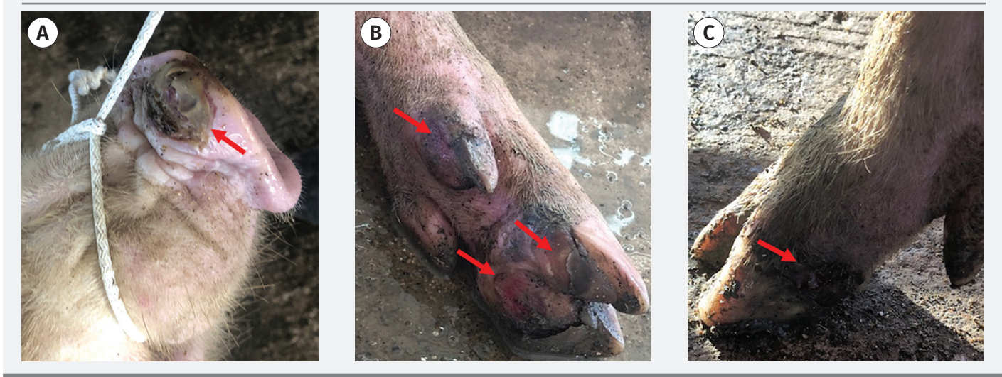
Journal of Swine Health and Production – November and December 2023

Figure 1: Lesions (red arrows) caused by Senecavirus A infection in gilts. A) Vesicle on the snout. B) Ulcerative lesions on the foot. C) Ulcerative lesion on the coronary band.