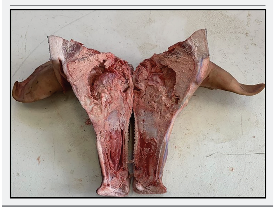
Figure 4: Skull thickness was measured from the point of bullet entry to the dorsal margin of the brain cavity. Skull penetration depth was measured with a probe following the path of the bullet from the point of entry to the point of exit or to the location where the bullet or fragments were identified.

Figure 3: A Sawzall saw (Milwaukee Tool) with a 20.32-cm all-purpose blade was used to cut the heads into equal halves.