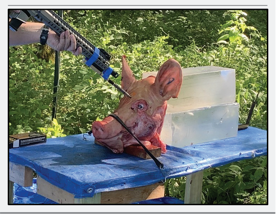
Figure 2: Measurement of entrance wounds were taken from the furthest margin on the skin to account for skin contraction after bullet penetration using a digital caliper.

Figure 1: Stabilization of head and demonstration of 12.7-cm jig used for positioning muzzle distance. A rubber tarp strap was positioned over the snout and securely fastened to each side of the table to ensure further stability of the target. Two ballistic gel blocks (40.64 cm long × 15.24 cm high × 15.2 cm wide) were placed directly posterior to the head and stacked with a 5.08-cm offset with the top block closest to head so that the total ballistics gel distance of the stack was 50.80 cm from top diagonal to bottom diagonal. These stacked ballistic gel blocks also provided support for the head.