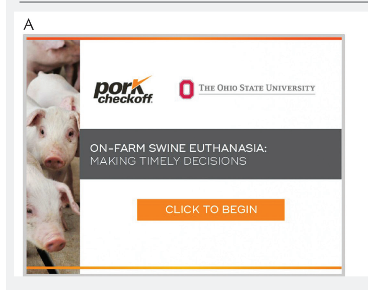
Figure 1: Screen capture from the timely euthanasia training application showcasing A) the starting page and B) the option menu to choose case studies for breeding stock, piglets, or wean to grow-finish pigs. This feature enables caretakers to learn about their production system but also to get additional useful information of other parts of the production system.

Of the 84 caretakers completing all training modules in the study, 2 caretakers failed to complete the post-training survey, resulting in a 97.6% response rate. The median age of the remaining 82 caretakers was 29 years (range, 18-59 years; first quartile = 24 years; third quartile = 42 years); 44 (53.7%) were 29 years or younger and 38 (46.3%) were older than 30. Of the remaining 82 caretakers, 71 (86.6%) self-identified as male and 11 (13.4%) as female. The mean work experience with pigs was 8.5 years (median = 2.25 years; range, 2 weeks to 52 years) with 41 (50.0%) caretakers having less than 2 years of work experience. Thirtyfour (41.5%) caretakers primarily worked in